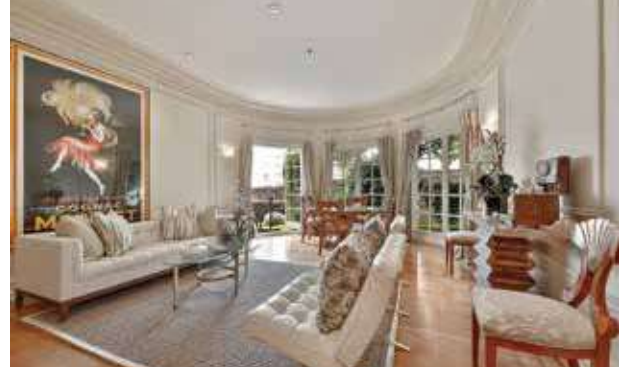
1080 Chestnut Street #11D, Russian Hill 3 Bed | 3.5 Bath | $3,800,000 1080chestnut-11d.com

Travis Hale Eva Daniel 415.517.7531 415.722.6150 DRE # 01343564 DRE # 00622428