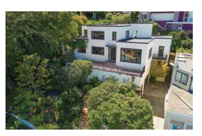
310 Twin Peaks Boulevard, Twin Peaks 4 Bed | 3.5 Bath | $3,995,000 310twinpeaksblvd.com

Marsha Williams 415.533.1894 DRE # 01187693