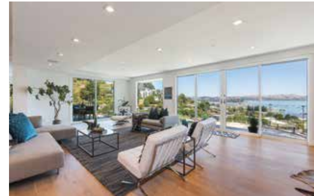
123 Woodward Avenue, Sausalito 4 Bed | 5 Bath | $4,900,000 123woodward-sausalito.com

Marsha Williams 415.533.1894 DRE # 01187693