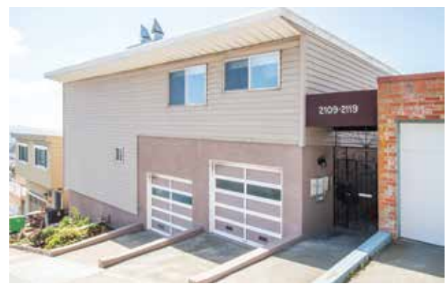
2109,2117,2119 14th Avenue, Golden Gate Heights 3 Homes | $1,595,000 each 14thavenueviewhomes.com

Denise Paulson 415.860.0718 DRE # 01268099