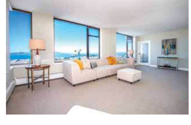
2190 Broadway St, #3W, Pacific Heights 2 Bed+Den | 3 Bath | $4,100,000 compass.com

Patricia Lawton 415.309.7836 DRE # 01233061