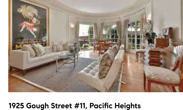
3 Bed | 2 Bath | $2,995,000 1925gough-11.com

Marsha Williams 415.533.1894 DRE # 01187693