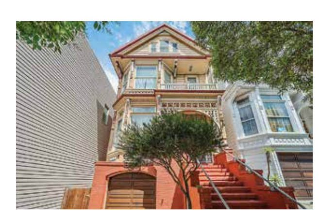
704 Ashbury Street, Haight Ashbury 6 Bed | 2 Bath | $2,900,000 compass.com

Joan Foppiano 415.806.4498 DRE # 01030132