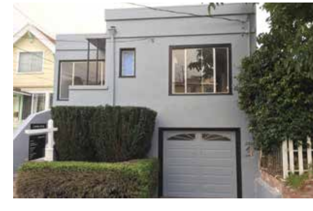
465 Harkness Avenue, Visitation Valley 4 Bed | 2 Bath | $899,000 465harkness.com

Reid Rankin Pauline Seddon 415.571.6606 415.770.5796 DRE # 01374892 DRE # 02081901